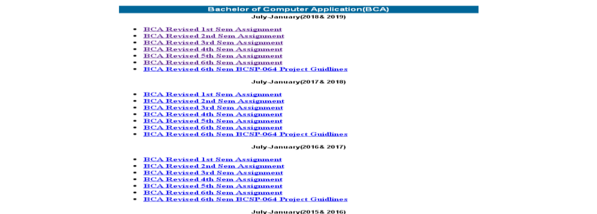
Figure 6: BCA Assignment Page

You may also download Assignments https://webservices.ignou.ac.in/assignments/bca/index.html