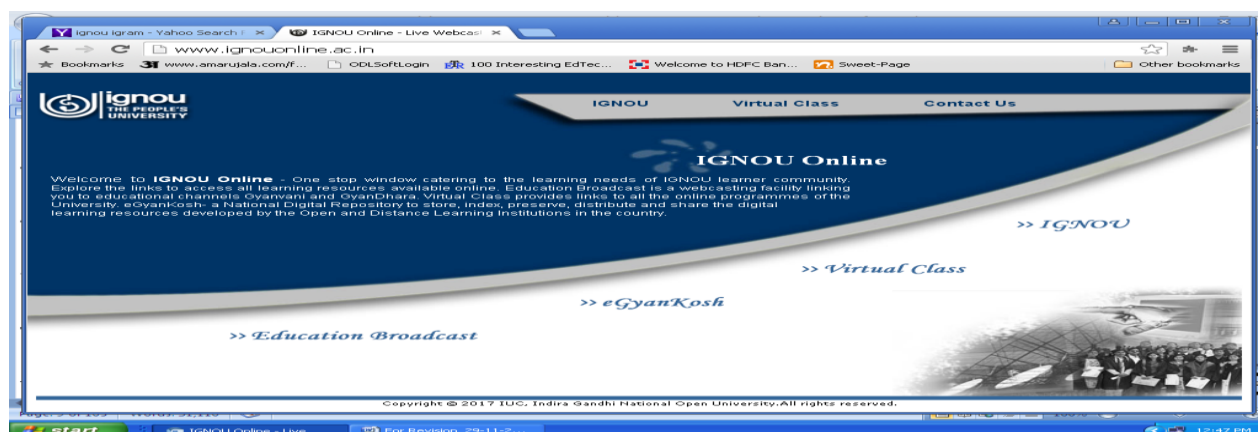
Figure-1: IGNOU Online

The live lectures based on BCA courses of SOCIS are telecasted on GD (Gyan Darshan) channel. The live telecast can be seen on http://www.ignouonline.ac.in/ . You can listen radio counseling programs on http://www.ignouonline.ac.in/ . Also schedule of GD (Gyan Darshan) lectures and Interactive Radio Counselling Program (IRC) can be seen on http://www.ignouonline.ac.in/