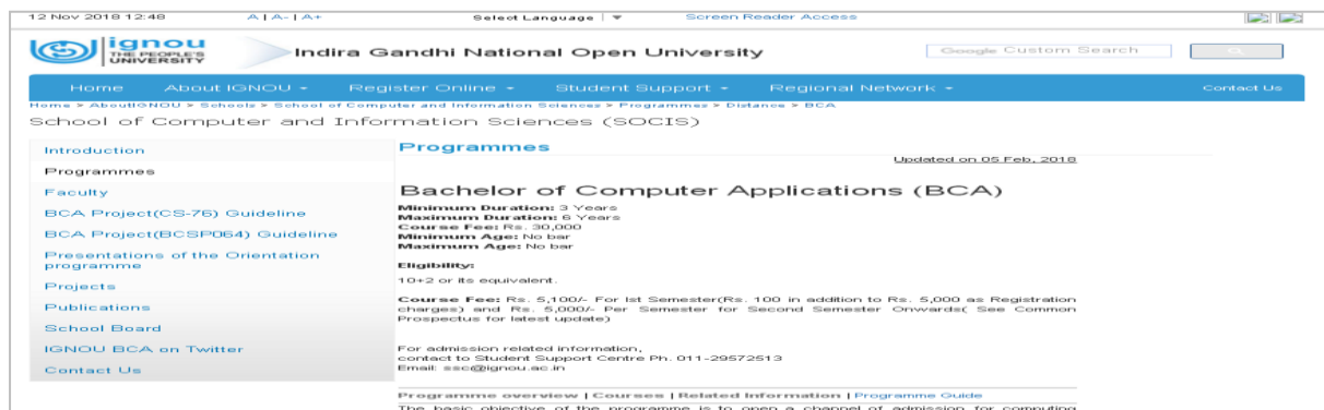
Figure 5: BCA Page

School of Computer and Information Sciences provides Computer Education Programmes. As soon as School of Computer and Information Sciences link is selected, a page introducing the school is displayed as shown in the Figure 5. The page BCA page of School of Computer and Information Sciences looks like this: