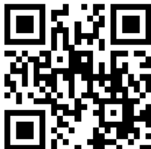
Forms for Students

Note: The above QR Codes can be scanned and open through and QR Code Scanner Application/App.