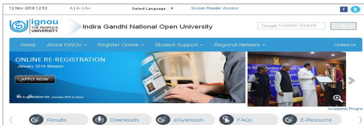
Figure 2: IGNOU Website

The learners can have access to IGNOU's website at the following address (URL) http://www.ignou.ac.in . As students get connected to this site, the following page displays the Home Page of IGNOU's web site (Figure 2). Students need to click on various options to get the related information.