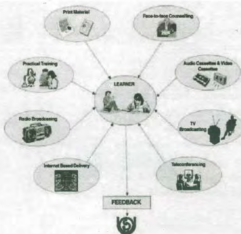
The learner-centric instructional system of IGNOU